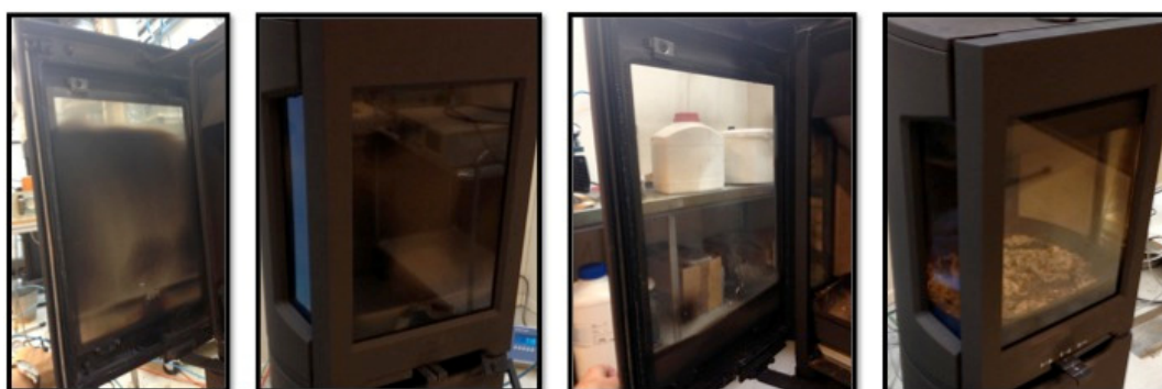
Figure 3. Soot on glass door after the testing. The conventional woodstove to the left and the prototype to the right.