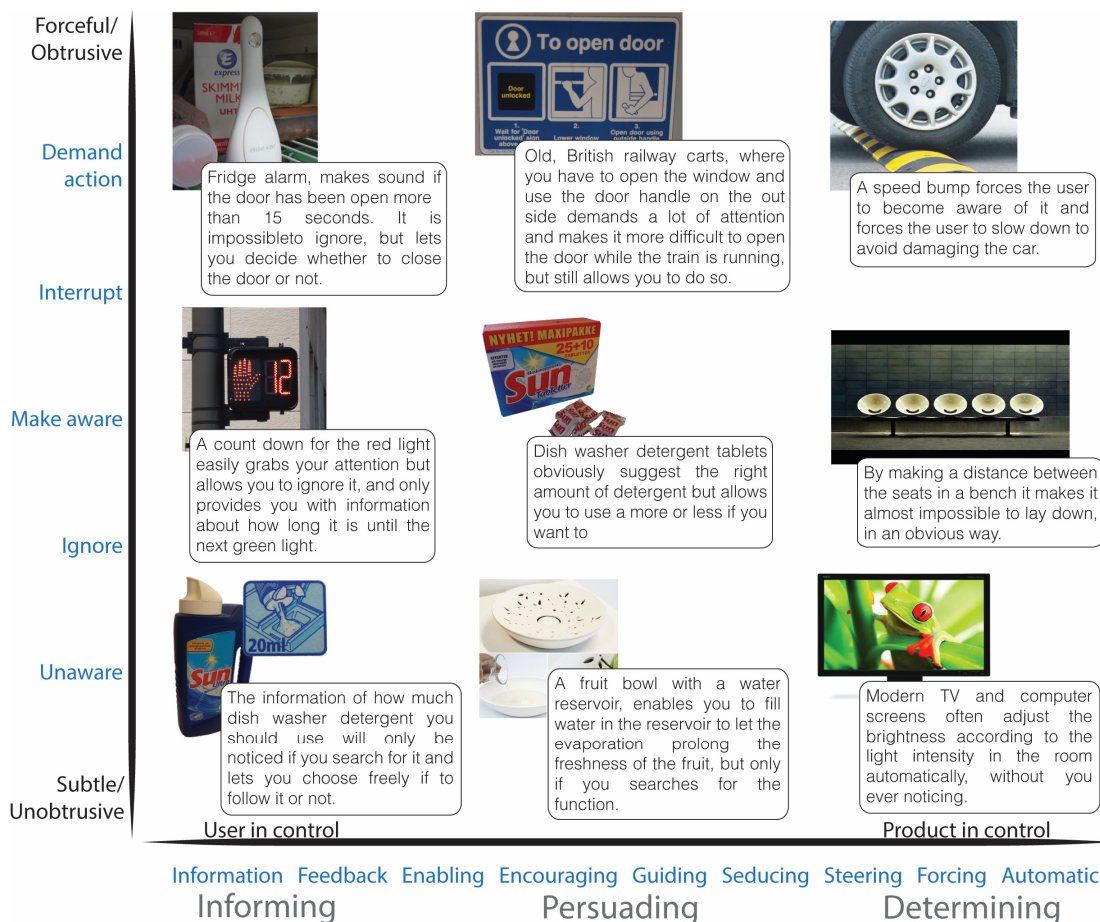
Figure 1. The landscape of Control and Obtrusiveness.

In the second part of the tool guidelines suggest which parts of the control-obtrusiveness landscape are more likely to have the desired effect on the behaviour of the user based on a number of user characteristics, such as whether the user has habits that should be changed, whether the user wants to behave in the desirable way or not, and how much attention would be required from the user.